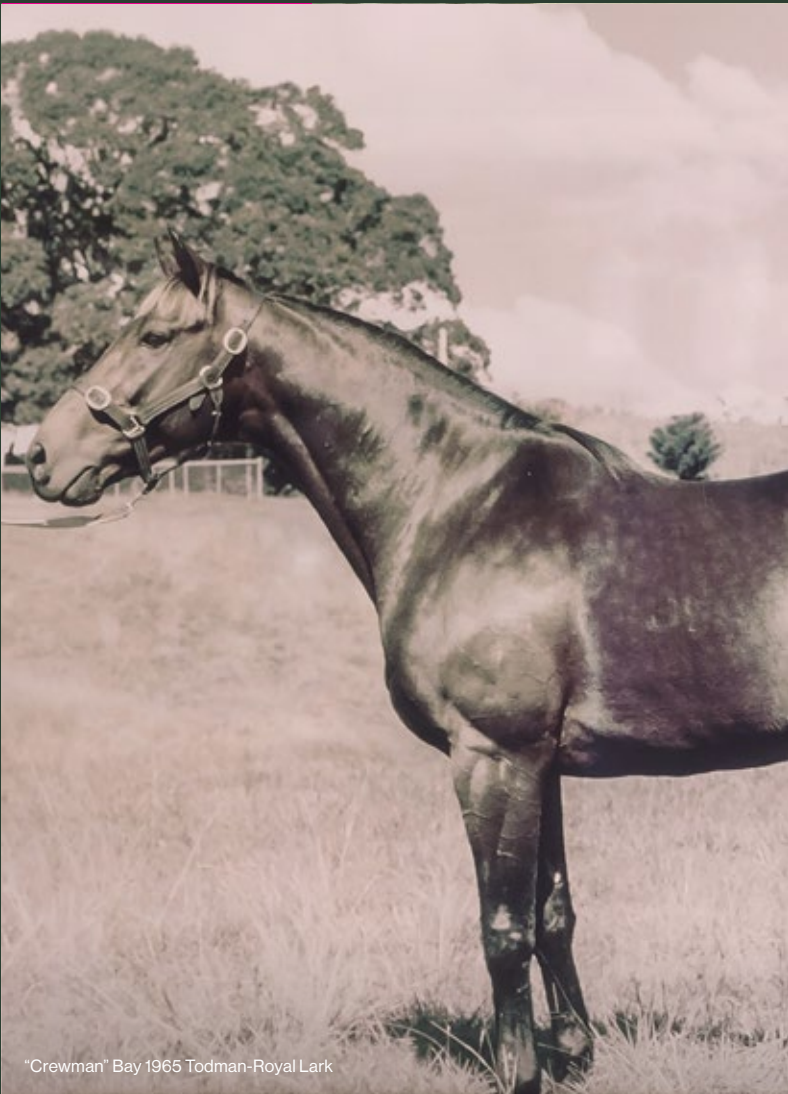
"Crewman" Bay 1965 Todman-Royal Lark

In its '70s heyday the Lodge had its own horse hospital, all-weather training track, and architect-designed stables and breeding barns — at one point, it even boasted its own airstrip.